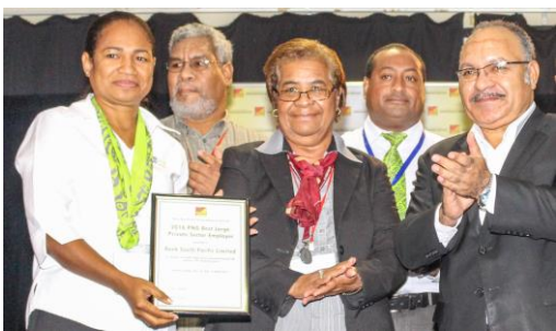
1. 2016 PNG Best Private Sector Employer (Large) – Bank South Pacific Limited

The 2016 performance awards give recognition to a registered business entity or company, a government department or entity, a state-owned enterprise organization and non-government organization (NGO) employer dully registered and operating in Papua New Guinea for more than 12 months, has a minimum of 20 employees and satisfactorily fulfils its people management responsibilities, as demonstrated by its leadership, dynamism, professionalism, strategic thinking and implementation, continuous improvement in HR processes and programs, linkage of HR to business objectives, and overall employee focus. The aim of the PNGHRI Best Performance Award is meant to give public honour & recognition to the company/organization that continuously strives to develop its human resources within their respective organizations for others to emulate its example. It also has a similar assessment and award to individual professionals and students in the HR profession. The Criteria integrate the standards and principles of the Papua New Guinea Human Resource Institute Inc.