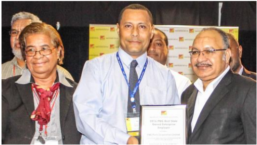
5. 2016 PNG Best State Owned Enterprise Employer – PNG Ports Corporations Limited