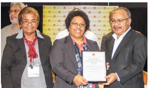
4. 2016 PNG Most Progressive Public Sector Employer – Internal Revenue Commission