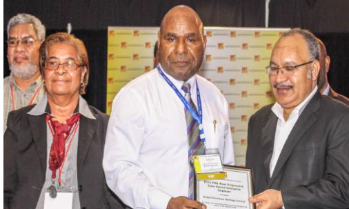
6. 2016 PNG Most Progressive State Own Enterprise Employer Kumul Petroleum Holdings Limited