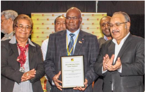
3. 2016 PNG Best Public Sector Employer – Civil Aviation Safety Authority of PNG (CASA)