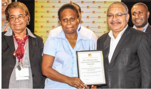
7. 2016 PNG Best Non-Government Organization Employer – Institute of Banking and Business Management