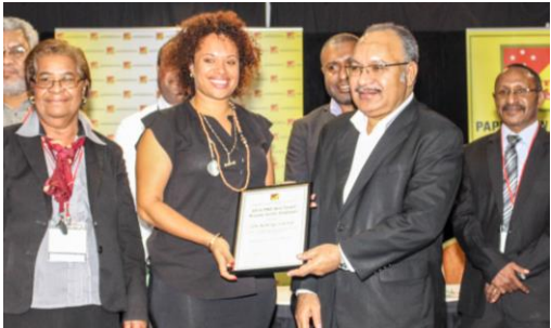
2. 2016 PNG Best Private Sector Employer (Small) – Lifu Holdings